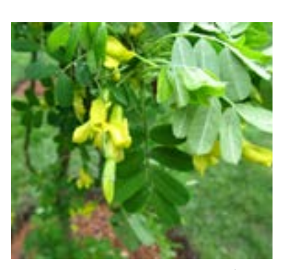
Jonathan Teller-Elsberg [CC BY-SA 3.0 (https://creativecommons.org/licenses/by-sa/3.0)]

Not all species that are aggressive in the garden will escape into Alaska's wild-lands and become problematic. e following compilation of species are garden owers, trees and shrubs that should be watched to keep them from spreading. As we learn more about how these species behave in Alaska, our list of invasive garden species not to plant will likely change.