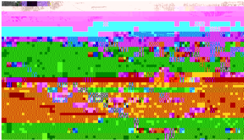
Environmental Process Flow chart