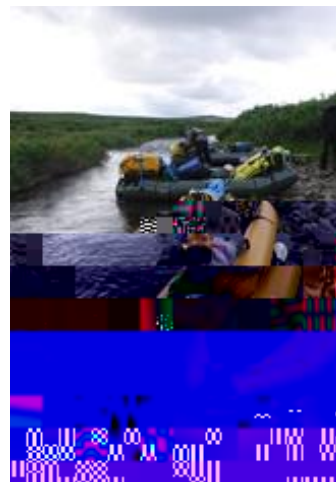
Canoe paddles are one type of lever. Archaeologists and other scientists use them while doing fieldwork.